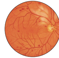
◀ Hypertensive retinopathy