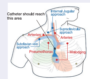
Anatomically accurate features including 3 insertion sites and rib cage