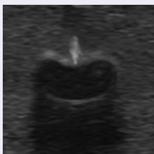
Ultrasound guided puncture