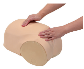
Palpation of uterine fundus