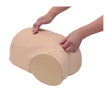
Measurement of fundal height