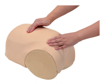
Palpation of uterine fundus