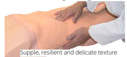
Supple, resilient and delicate texture