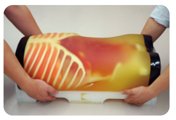
1. The Phantom is heavy. For your safety, always carry the phantom with two people.