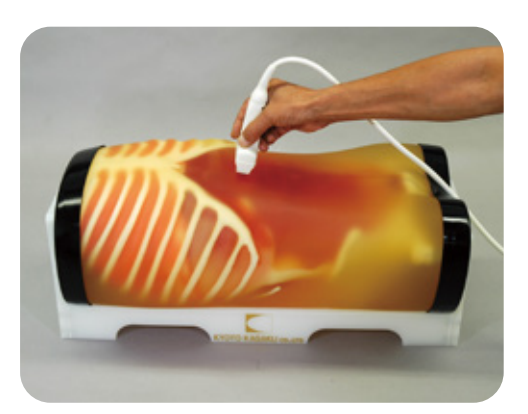
The phantom can be scanned with actual ultrasound devices.

* The map of simulated hemorrhages and tumors is on the backside of this manual.