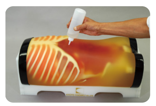
2. Spread ultrasound gel over the phantom body.