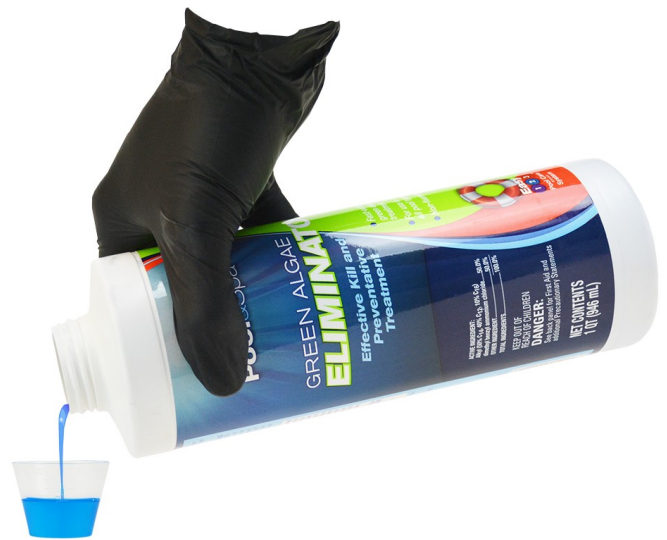
SynDaver Storage Solution

If any malodor develops before your regular replenish cycle is complete, reduce the time period between water changes.