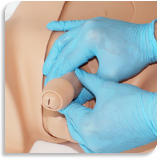
Accurate anatomical modelling