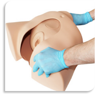
Aseptic catheterisation technique